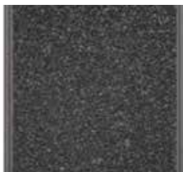
Black with black insert