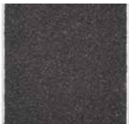
Natural with black insert